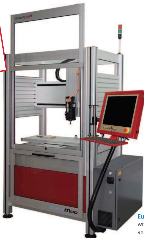
EuroMod MP 45 with control panel iOP-19-TFT and open sliding door